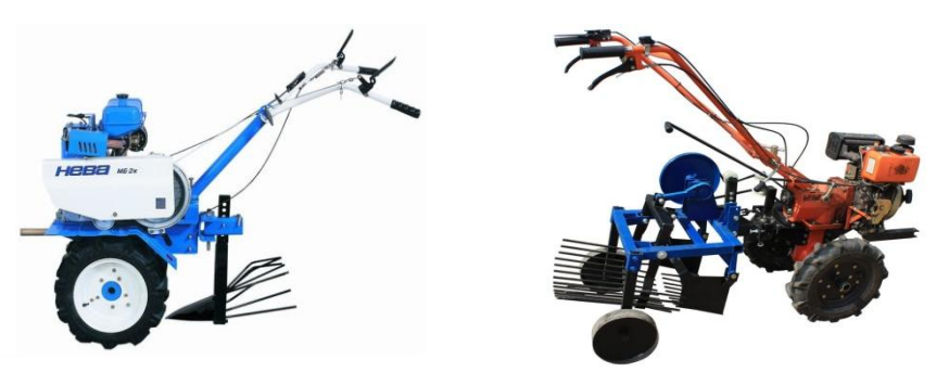
Figure 1. Motoblocks equipped with excavating working bodies of various constructions

In recent years, motoblocks have been widely used in the harvesting of root crops grown in gardens. A digging working body mounted on motoblocks is designed to remove the roots from the ground. The advantage of using motoblocks in the harvesting of roots, mainly on farmland, is low labor and energy efficiency. Its disadvantages are the inconvenience of movement of the motoblock controller from the rear and in some cases the fact that a large amount of soil sticks to the working body and the working body is buried in the ground.