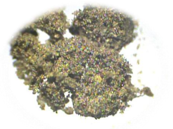
Fig. 1. Snapshot of a graphite ore sample at 100x magnification