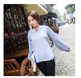
(b) Mask R-CNN.