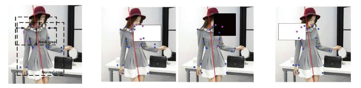
Fig.3. The bigger bounding box in the first figure is the Normal-crop for universal tasks and the smaller one is the Neck-crop, a refined bounding box specialized for upper body design tasks. The remaining figures show the detection results with occlusions.

On the next stage, the minimum and maximum coordinates of key-points and feed a corresponding bounding box to New-key-detection again to obtain the second time refined key-points repeatedly in case of missing parts of clothes like the right cuff in Fig.1(b). Finally, we have derived the average of two scales' predicted key-points as the final output of key-points. We have elucidated the illustration of dealing with different occlusions in Fig.3.