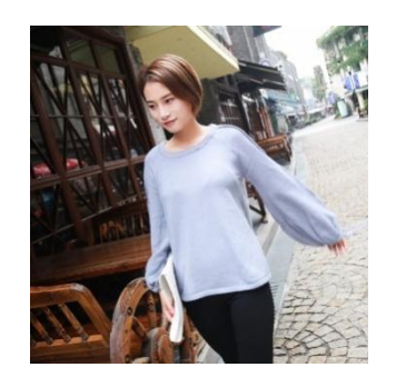
(a) Origin image.

Popularity and growth have been recently observed in the E-commerce of apparel in the online market. The critical for e-commerce plat-form is considered as automatic and certain garments recommendation in order to grow up its sales and profits. That recommendation has depended heavily on high-performance apparel recognition and detection.