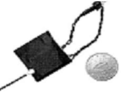
Fig.1 MicroWi-Fi Recorder