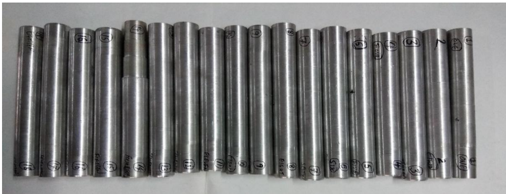
Figure 1. Specimens of A7075 reinforced with flyash and SiC.

Average surface roughness (Ra) of 16 specimens was measured with Surface Roughness measuring instrument Mitutoyo’s Surftest SJ-210. Surface roughness is measured at three different locations and average value is taken.