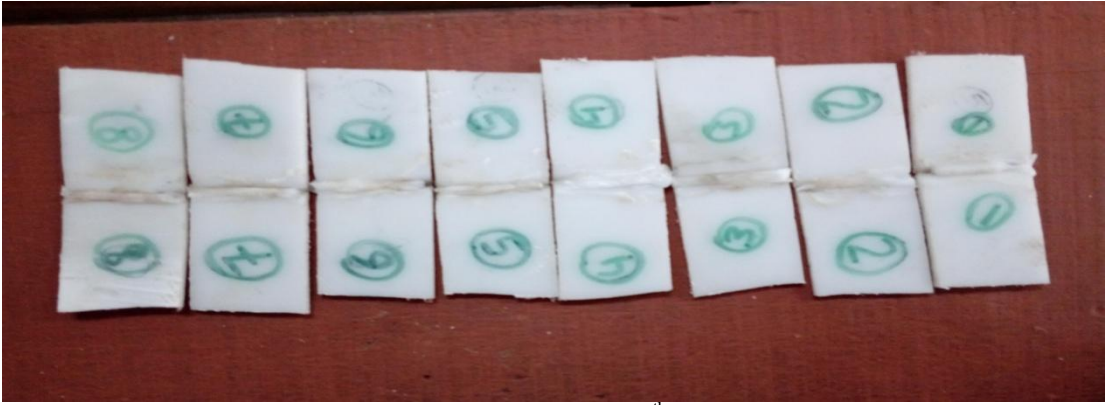
Figure 1 Weld bead formed in 1 to 8<sup>th</sup> experiment