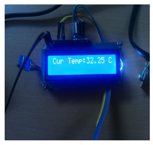
Fig 3: The body temperature of the user in LCD display.