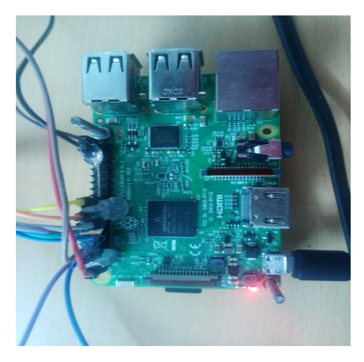
Fig 2: The Raspberry pi which controls the overall operation of this proposed system