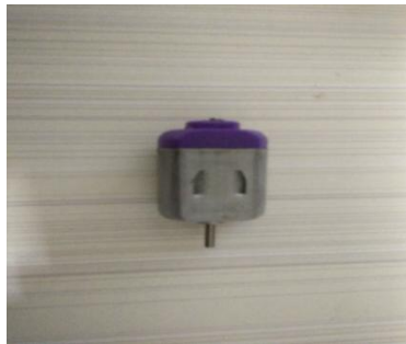
Fig 7. DC Motor

When the current is given to the supply, it produces magnetic field. When the current carrying conductor is placed under the magnetic field, the force is exerted on the current carrying conductor. As a result, the rotor rotates. The high rpm motor is suitable to cut the grass.