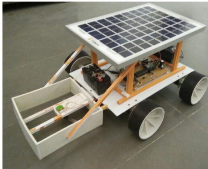
Fig 8. Solar Based Grass Cutter