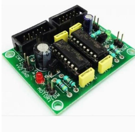
Fig 6. Motor Driver

inbuilt H bridge driver circuits to operate 2 DC motors simultaneously both in forward and reverse direction by controlling the input logic from pin 2 and 7 and 10 and 15 rotating in both clockwise and anti clockwise direction.