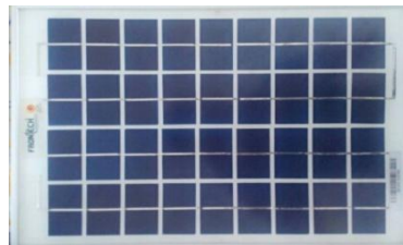
Fig2. Solar Panel

A Solar Panel is a series of structurally arranged solar cells which works on the principle of photovoltaic effect. When the Solar Panel receives photons from the Sun, there is a creation of electron of higher energy, and electric field is required to drive the electron causing the flow of electricity. Solar panel consists of p and n dope semiconductor. This yields in the formation of p-n junction causing the formation of electric field. When a photon strikes the junction, there is a transfer of light energy leading the electron to get to higher energy level to overcome the potential barrier of the junction causing the flow of electricity.