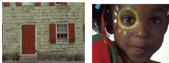
Fig 2 Images from TID2008 Database 3.3 NOISE ESTIMATION IN MEASTEX

EstimateNoiseVariance algorithm which calls GetUpperBound and GetNextEstimate. GetUpperBound taken as the initial estimate and iteratively calls algorithm GetNextEstimate until convergence is reached. Algorithm GetUpperBound computes a noise variance upper bound. This algorithm is independent from image block PCA in order to increase the robustness of the whole procedure. The PCA is used to reduce the complexity and noise level.